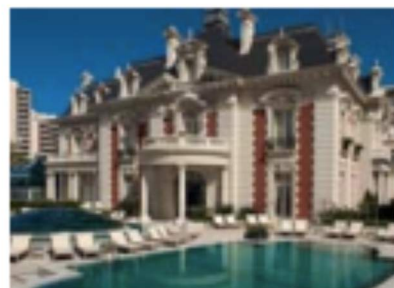
The revamp began more than a year ago

The group is also set to enter Russia after signing an agreement with IPG Basis Proect to manage a luxury hotel in St Petersburg. Read more: http://lei.spa=3d4C or http://lei.spa=14N7Z