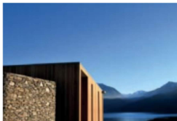
The retreat focuses on nature, adventure and self-development

When searching for the location, factors including natural beauty, energetic feel, access, social structures, stability and international appeal were considered.